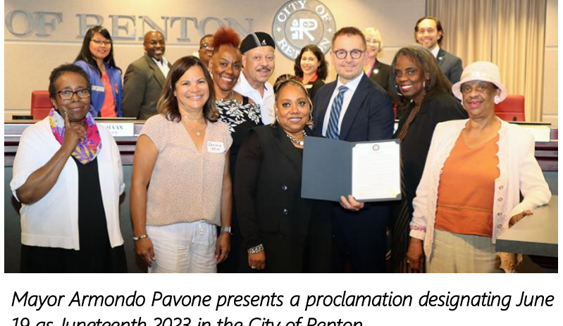
19 as Juneteenth 2023 in the City of Renton.

The report is available for translation on our